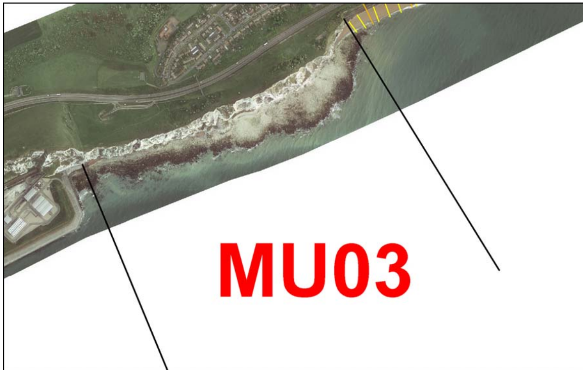
Figure 1: Management Unit 03 (Shakespeare Cliffe)